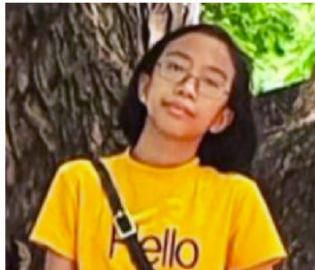
Buranakan Thayika, Thailand

During the COVID-19 period, the school adopted online teaching, where I learned classroom / virtual classroom etiquette on how to get along with other classmates.